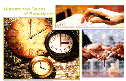
BTI Group, established in 1981 has sold over 5,000 businesses to private equity groups, strategic buyers and individuals.